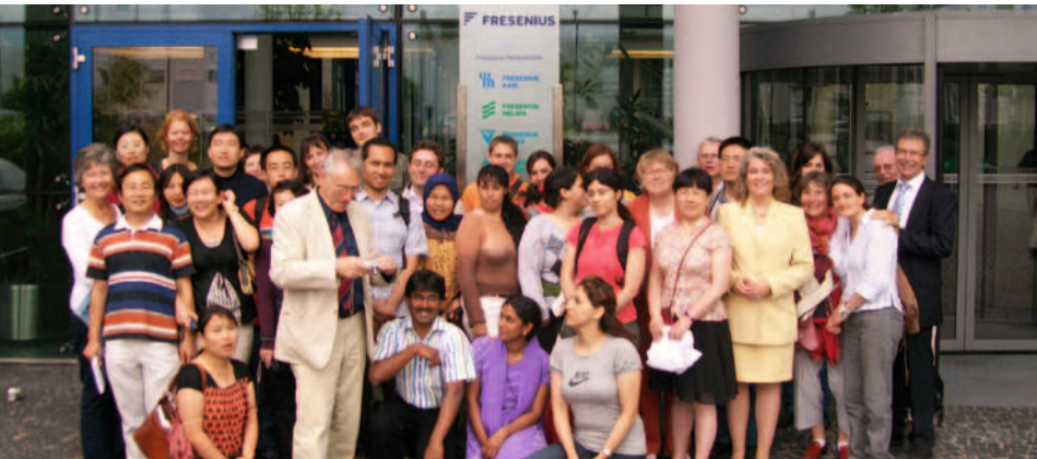
On tour: The group of DKFZ guest scientists enjoyed an informative and pleasant day.

In the early afternoon our group arrived at the Saalburg, the world’s only reconstructed Roman fort and archeological museum – just next to the Limes World Heritage Site, the ancient frontier between the Roman Empire and the