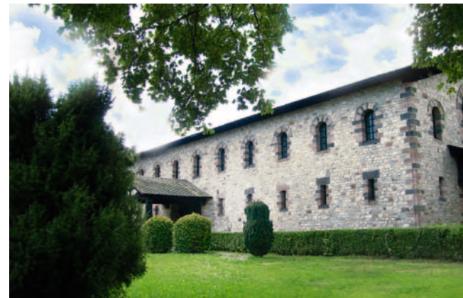
The impressive Saalburg Roman Fort offered a vivid picture of the ancient life at the Limes.

Germanic tribal territories. On this trip through time, all participants of the excursion got a vivid picture of the history, culture and customs of an era whose heritage – although almost two thousand years old – still shapes our world today.