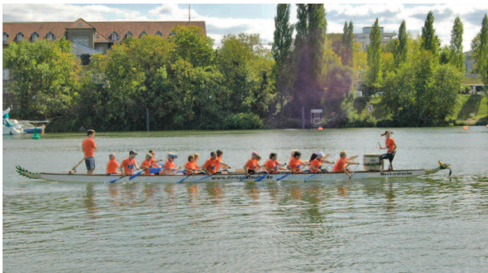
Joint forces: 20 former cancer patients started on the race in a dragon boat.