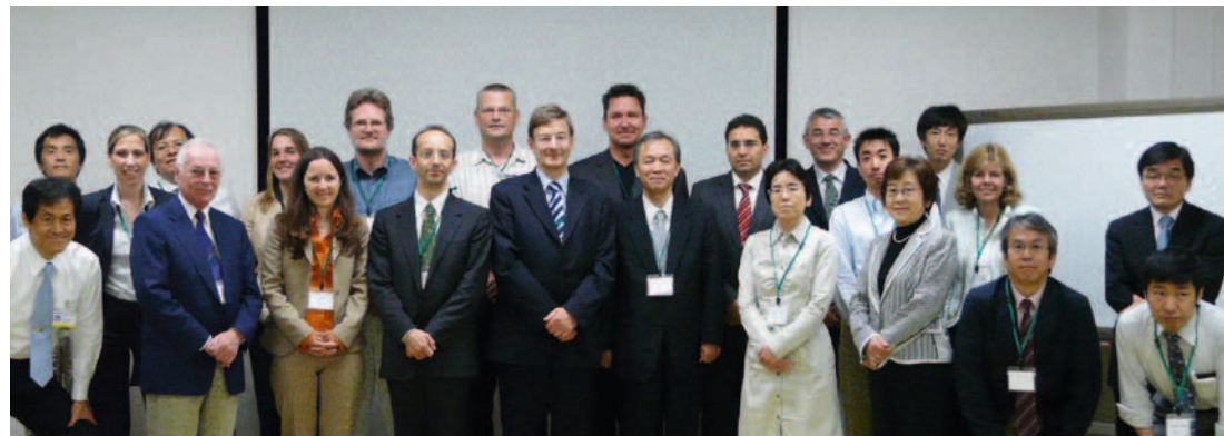
The twelve-strong delegation from DKFZ was welcomed with extraordinary hospitality at the National Cancer Center in Tokyo. During the two days new issues for mutual collaboration were identified.