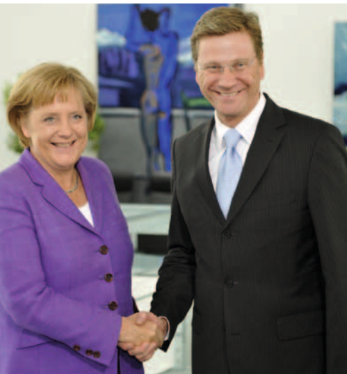
New coalition partners: Angela Merkel, German Chancellor and leader of the conservative Christian Democratic Union party (CDU), and Guido Westerwelle, leader of the Free Democrats (FDP) meet at the Chancellery in Berlin September 28, 2009.

Great excitement filled Germany on the last Sunday in September, the day of the election of the Bundestag. Would the alliance of the Christian Democratic Union (CDU), and her Bavarian counterpart the Christian Social Union (CSU) together with the liberal party (FDP) succeed in winning the majority of votes for the Bundestag once again after 1994? The FDP under leadership of Guido Westerwelle had been unambiguous in the run-up to the elections: They would only consider this kind of coalition. According to opinion polls before the election there seemed to be an edge for the CDU/CSU and the FDP. Nevertheless, suspense was guaranteed as one had to keep in mind, that, in a similar situation four years ago, the opposing parties achieved a turnaround right before the election.