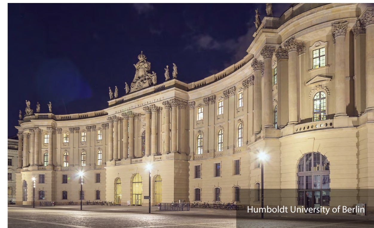
Humboldt University of Berlin