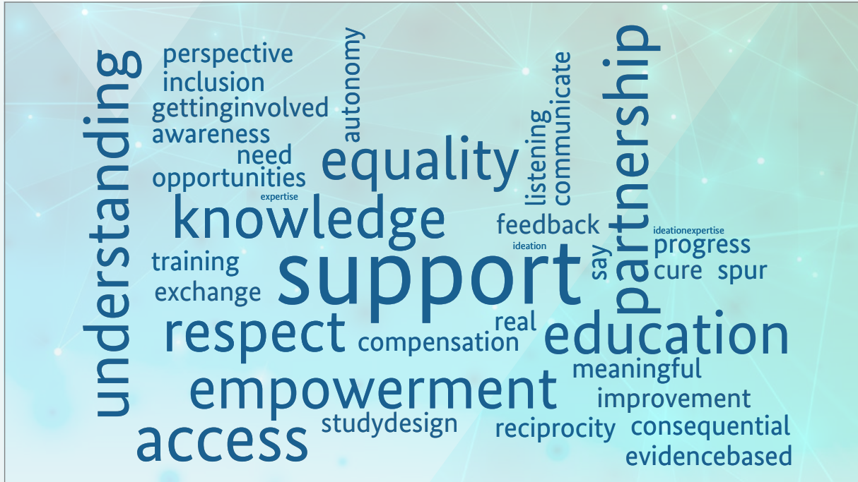
Figure 2: Word cloud of 45 phrases collected by participants in session 1 “Vision” of the online workshop in December (in response to the question: “Which catch words would you choose to describe your personal vision or ambition regarding active patient involvement in cancer research?”)

The following chapters, 1) A Shared Vision, 2) Strategy, Level and Timing of Involvement, 3) Communication, Understanding and Relationships, 4) Resources, Knowledge and Skills, 5) Methods and Approaches, and 6) Ethical and Legal Aspects, present the collated principles in detail, as derived from discussions in the workshop series during the bottom-up process.