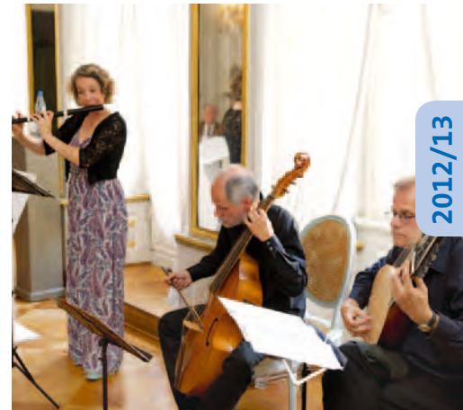
Trio flauto con bassi