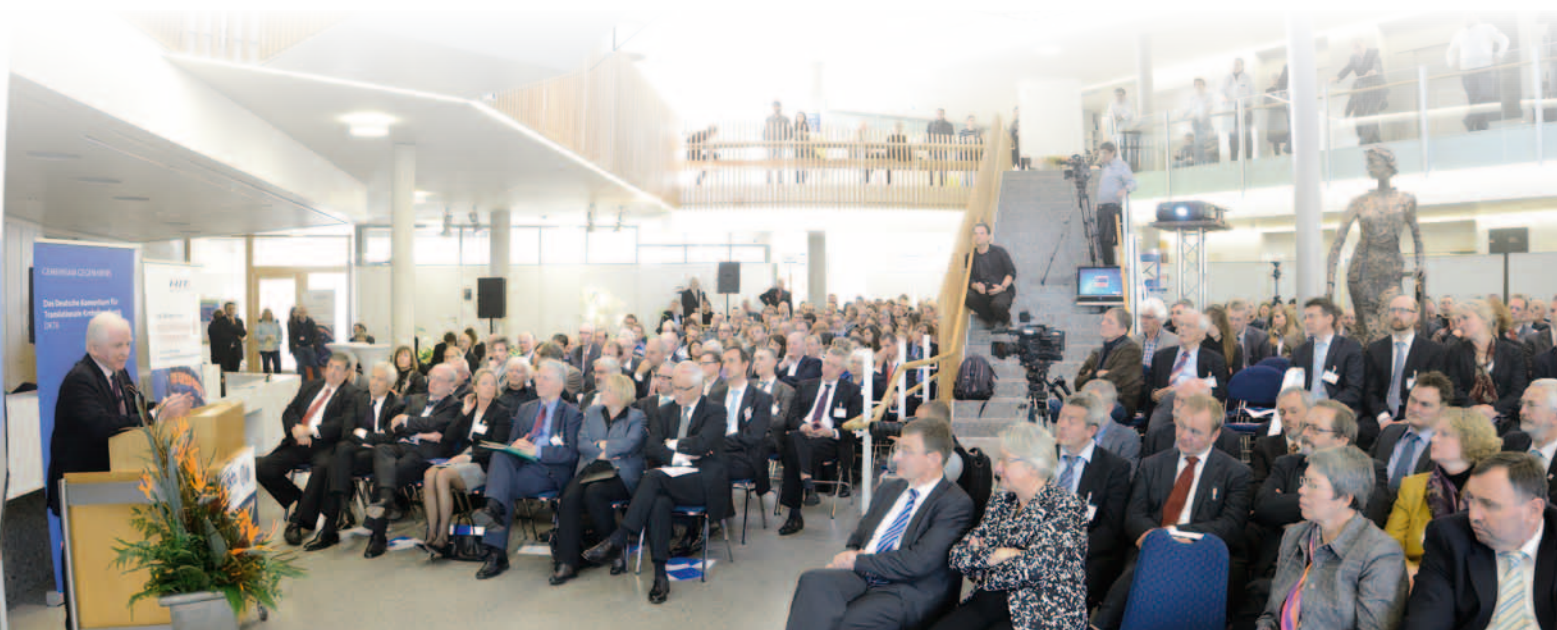
Celebration in the foyer of the National Center for Tumor Diseases Heidelberg with Prof. Harald zur Hausen at the speaker's desk

In the following panel discussion, scientists and oncologists of DKTK presented aspects of individual programs in the new consortium. The clinical communication platform of DKTK for instance will ensure that patients have the possibility to participate in clinical trials best suited for them anywhere in Germany. Using the example of pediatric cancer, researchers of the consortium finally explained the prospect of improved cancer therapies emanating from sequencing individual tumor genomes. For more details on DKTK see Newsletter issue 2011, p. 1.