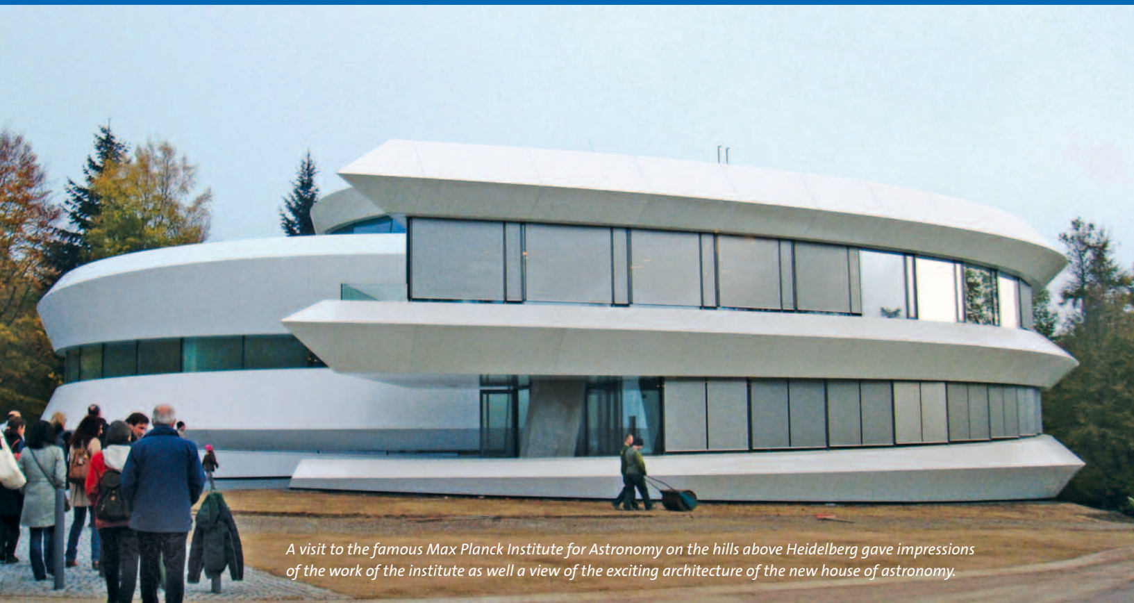
A visit to the famous Max Planck Institute for Astronomy on the hills above Heidelberg gave impressions of the work of the institute as well a view of the exciting architecture of the new house of astronomy.

within Germany: Sparkasse Heidelberg, account number (Kontonummer) 1000597810, bank identification code (Bankleitzahl) 67250020. from abroad: Sparkasse Heidelberg, IBAN: DE31672500201000597810, BIC/SWIFT: Solade S1 HDB.