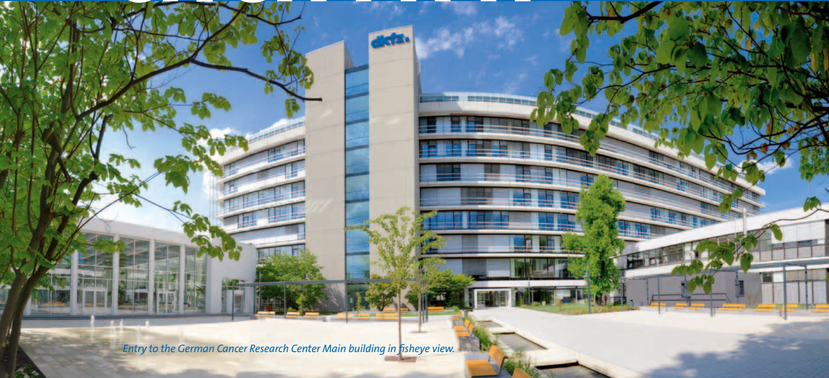
Entry to the German Cancer Research Center Main building in fisheye view.